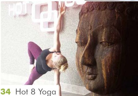
34 Hot 8 Yoga