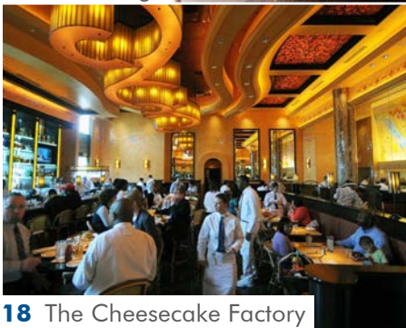
18 The Cheesecake Factory