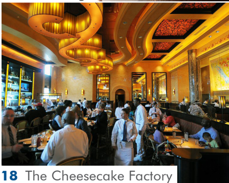
18 The Cheesecake Factory