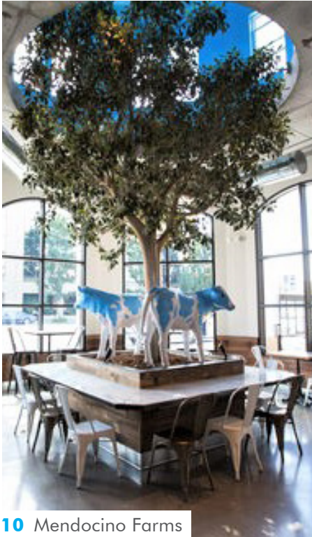
10 Mendocino Farms