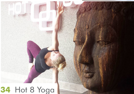
34 Hot 8 Yoga